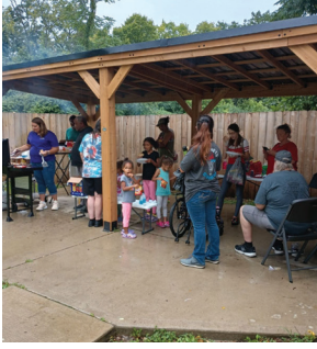
St. Joseph Apartments