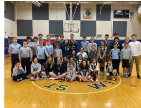
Reach & Teach