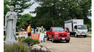
Food for Friends Pantry