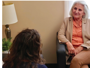
Mental health counseling